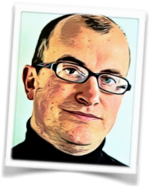
Mark Stephens Architects